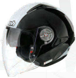
CODE: J135 BICOLOR