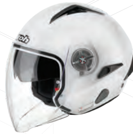
CODE: J114 COLOR