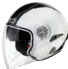
CODE: J138 BICOLOR