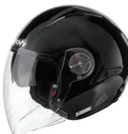
CODE: J102 SPORT NOT PAINTED