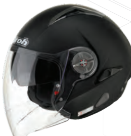
CODE: J111 COLOR