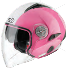
CODE: J168 BICOLOR