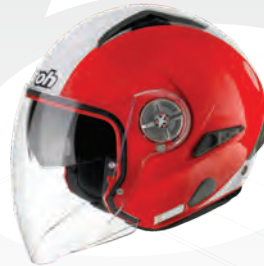
CODE: J155 BICOLOR